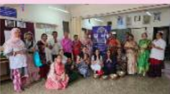
IWC pune river rhythm organised sound healing meditation session for mental health of senior