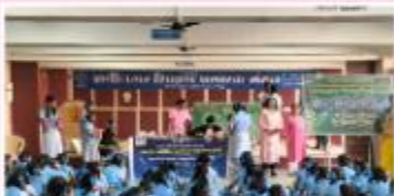
IWC Nigdi Pride conducted hemoglobin check up camp for 640 students Worth Rs 5000/-