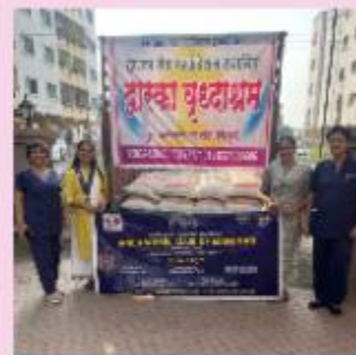
IWC MANCHAR DONATED CEMENT BAGS WORTH RS 15,000/- FOR ORPHANAGE CONSTRUCTION