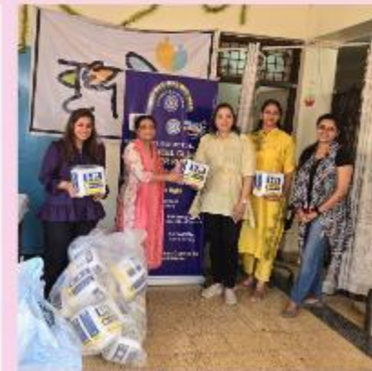
IWC Pune River Rhythm donated adult diapers Worth Rs 10,850/-