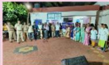
IWC MANGALWEDHA ORGNISED MUSICAL EVENING ON PATRIOTIC SONGS