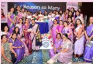
IWC KHOPOLI DISTRIBUTED STICKERS ON ROAD SAFETY WORTH RS 5000/-