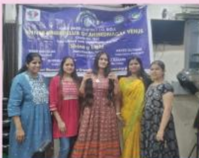
HAIR DONATION FOR CANCER PATIENT IWC AHMEDNAGAR VENUS