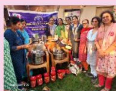
IWC PUNE MIDDTOWN DONATED UTENSILS AND ESSENTIAL ITEMS TO OLD AGE HOME WORTH RS 55,000/-