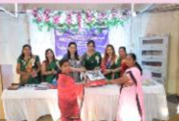
IWC KOREGOAN DONATED COAL HEATER TO ZP SCHOOL WORTH RS 2000/-