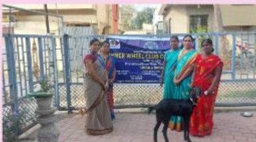
IWC SANGOLA DONATED GOAT TO NEEDY WOMEN WORTH RS 4100/-