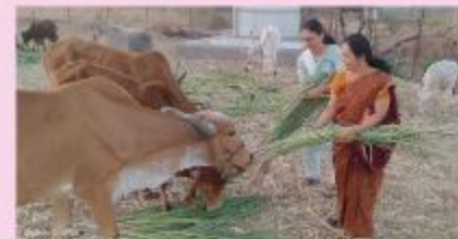
IWC LONAND DONATED CATTLE FEED WORTH RS 3500/-