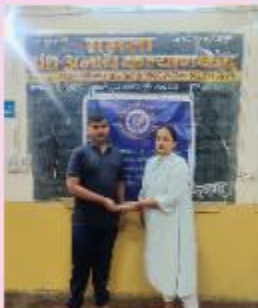
IWC BANER HILLS PAID EDUCATIONAL FEES RS 5000/- OF BLIND STUDENT