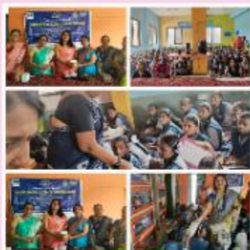
IWC Ahmednagar arranged lecture on menstrual hygiene and distributed kit Worth Rs 7000/-