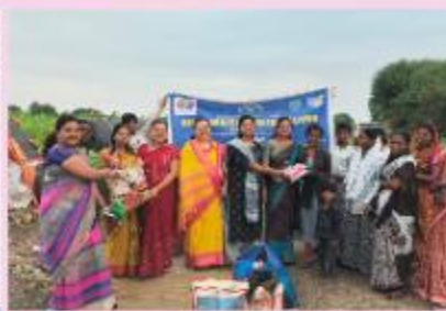
IWC KALAMB DONATED OLD CLOTHES TO SUGARCANE FARMERS