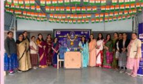
IWC PUNE IMPERIAL - 1,86,000/-