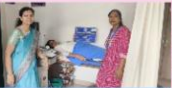
IWC solapur harmony conducted cervical cancer check up for 40 ladies worth Rs 40,000/-