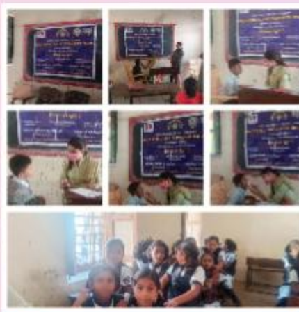
IWC pandharpur pearls conducted dental checkup camp for children worth Rs 4000/-