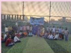
IWC JAINA CENTRAL ORGANISED CRICKET MATCHES