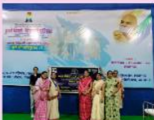
IWC AMBAJOGAI ORGANISED MOTIVATIONAL SPEECH