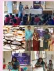
IWC pune conducted eye checkup camp for 152 students, distributed spectacles, worth Rs 15,500/-