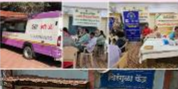
IWC pune central conducted cancer check up camp worth Rs 37,500/- for 96 people