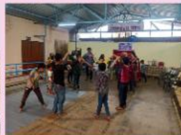
IWC SHEGAON ORGANISED BAL SANSKAR CLASS FOR CHILDREN