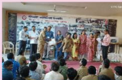
IWC SANGAMNER DONATED GROCERIES WORTH RS 25000/- TO GHANTA GADI WORKERS