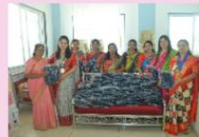
IWC WAI DONATED 100 SWEATERS WORTH RS 40,000/-