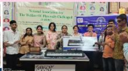
IWC POONA NORTH DONATED MUSICAL INSTRUMENT - CASIO WORTH RS 19,000/- TO DIFFERENTLY ABLED CHILDREN