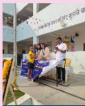
IWC LATUR ORGANISED SPORT DAY FOR MENTALLY CHALLENGED CHILDREN