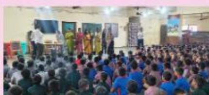
IWC New parvel conducted informative seminar on anti drugs at school