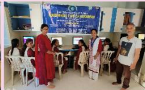
IWC KURUDWADI SPONSORED TALLY MS CIT COURSE WORTH RS 10,000/-