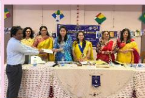
IWC pune imperial donated 65,760/- to FPAI for hormone replacement therapy of 6 transgenders