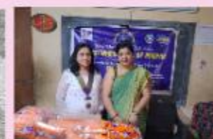
IWC Pimpri donated sanitary pads Worth Rs 2100/- in school