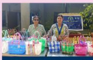
IWC PANCHGANI SPONSORED STALL OF HOMEMADE BAGS FOR NEEDY WOMAN