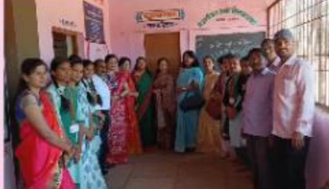
IWC NIGDI PRIDE - 1,44,938/-