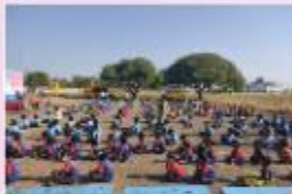
IWC Ahmedpur conducted Surya namaskar workshop for 400 students