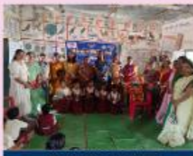
IWC PAITHAN CONDUCTED HANDWRITING COMPETITION