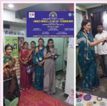
IWC Tembhumni arranged health checkup camp of members