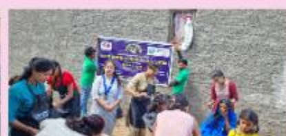
IWC area 24 latur organised hair cutting camp for 48 underprivileged girls worth Rs 12,500/-