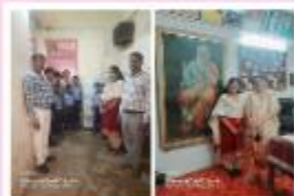
IWC pune riverside donated water purifier Worth Rs 1,22,000/- for 150 students