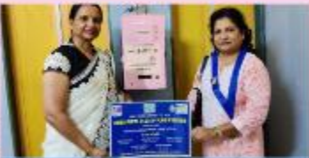
IWC pune riverside donated incinerator machine for disabled girls worth Rs 6500/-