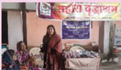
IWC BARSHI DONATED FOOTWEAR WORTH RS 1500/- TO SENIORS