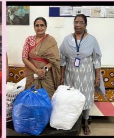
IWC GALAXY NEW PANVEL DONATED FOOD, OLD CLOTHES, NEW FOOTWEAR TO DIFFERENTLY ABLED WORTH RS 5000/-