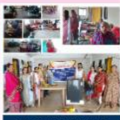
IWC MALKAPUR SUNRISE DONATED WASHING MACHINE TO OLD AGE HOME WORTH RS 52,000/-