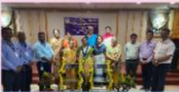
IWC Aurangabad donated 2 wheel chairs worth Rs 21,450/-