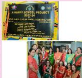
IWC PANVEL INDUSTRIAL TOWN HAPPY SCHOOL - 1,47,000/-