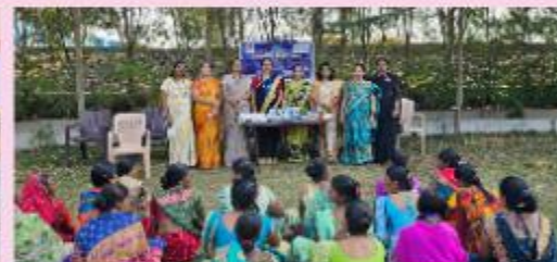
IWC KARAD FELICITATED WOMEN EMPLOYEES WHO WORKED AT MUNICIPAL SOLID WASTE MANAGEMENT