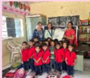
IWC Talegaon dabhade donated water purifier worth Rs 15,000/-