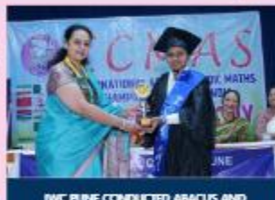
IWC PUNE CONDUCTED ABACUS AND VEDIC MATHS COMPETITION