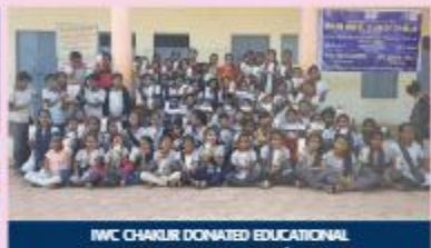
IWC CHAKUR DONATED EDUCATIONAL MATERIALS WORTH RS 18000/- FOR 160 STUDENTS