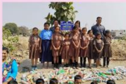
IWC SOLAPUR COLLECTED WASTE PLASTIC AND CREATED ECO BRICKS BY STUDENTS