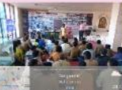
IWC sangamner conducted lecture on how to maintain hygiene for ghanta gudi-washers