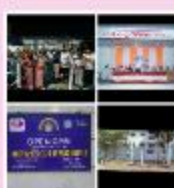
IWC pandharpur build open gym Worth Rs 78,000/-