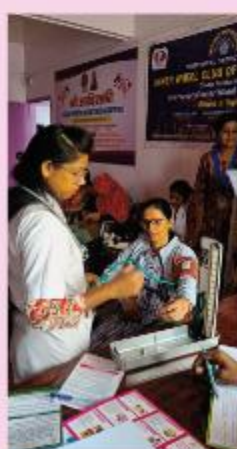
IWC Narayangan conducted free check up breast cancer camp and donated 25,000/- for chemotherapy to one patient