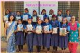
IWC pune vings donated sanitary pads Worth Rs 1600/-