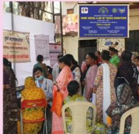
IWC Poona Downtown organised mega whole body checkup camp with 119 registrations, and paps smear test done of 39 ladies Worth Rs 7000/-