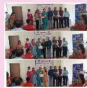
IWC SATARA CAMP ORGANISED ESSAY COMPETITION FOR STUDENTS AND SPENT 6000/-