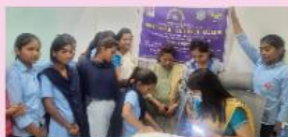
IWC udgir conducted free skin care check up camp worth Rs 7000/-