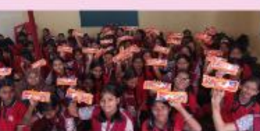
IWC Jalna donated sanitary pads Worth Rs 3500/-