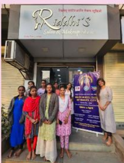
IWC PANVEL CITY CONDUCTED BASIC BEAUTICIAN COURSE WORTH RS 80,000/- FOR 8 UNDER PRIVILEGED GIRLS