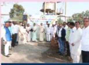
IWC JAUNA CENTRAL - HAPPY SCHOOL WORTH RS 1,70,485/-