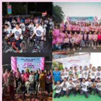
IWC jalna horizon organised pink pedal cyclathon to create awareness on cancer, also gave 4 cycles to needy girls total event cost 1,00,200/-