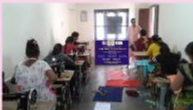
IWC NANDED ORGANISED 3 MONTHS SEWING CLASSES