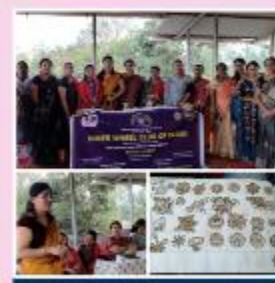
IWC PATAN ORGANISED WORK SHOP ON AARI WORK AND ADVANCE MEHENDI