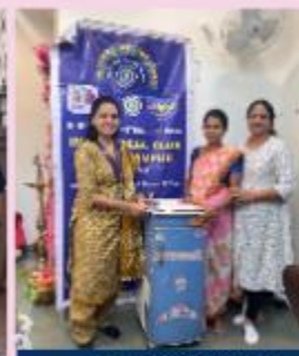
IWC SHRIRAMPUR DONATED FLOUR MACHINE WORTH RS 8500/-