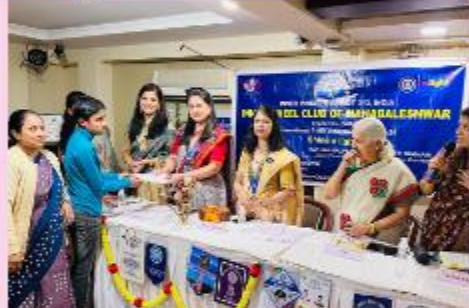
IWC MAHABLESHWAR PAID EDUCATIONAL FEES RS 10,500/-