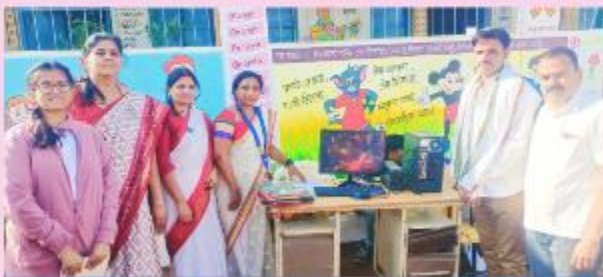
IWC AURANGABAD LOTUS - 85,839/-