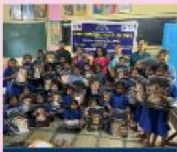
IWC PEN DISTRIBUTED EDUCATIONAL MATERIALS WORTH RS 26,500/-