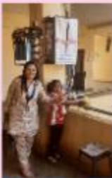
IWC pune platinum donated water purifier Worth Rs 16,498/- for 145 students