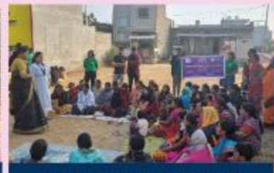
IWC AREA24 LATUR CREATED AWARENESS ABOUT WOMEN'S LAW AMONG LESS FORTUNATE LADIES