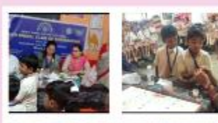
IWC shrirampur organised blood check up camp for 450 students Worth Rs 6000/-