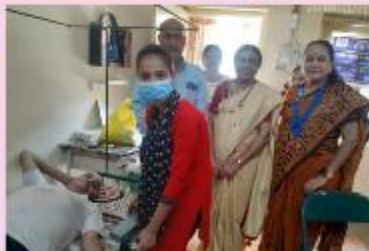
IWC Bhor conducted medical camp for seniors