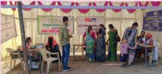
IWC solapur starlet conducted health checkup camp for siddheshwar yatra worth Rs 11000/-