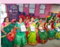
IWC pune uplona conducted session on developing friendship through therapies