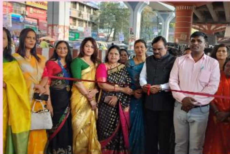
IWC PUNE UPTOWN ORGANISED EXHIBITION TO PROMOTE WOMEN BUSINESS